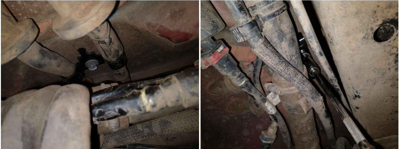
Figures 1 and 2. Removing the Factory Parking Brake Cable Bracket