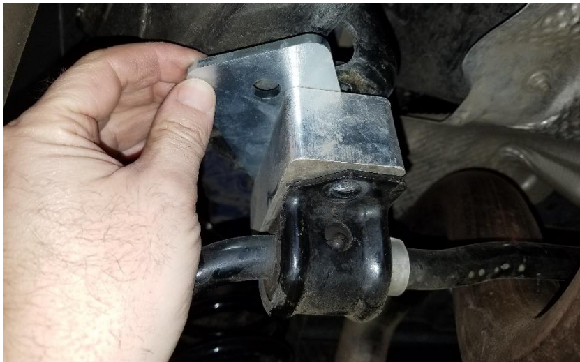
Figure 5. Sway Bar Spacer Plate Install on the Driver Side Sway Bar Mount