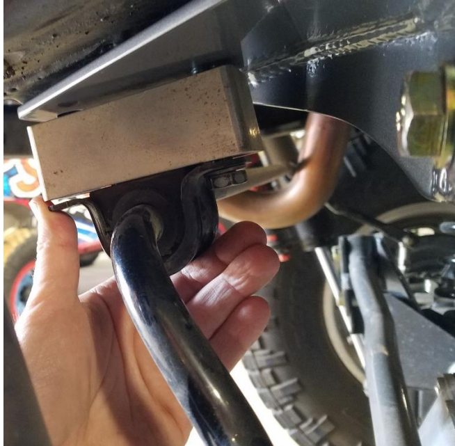
Figure 4. Installing the Passenger Side Rear Sway Bar Mount