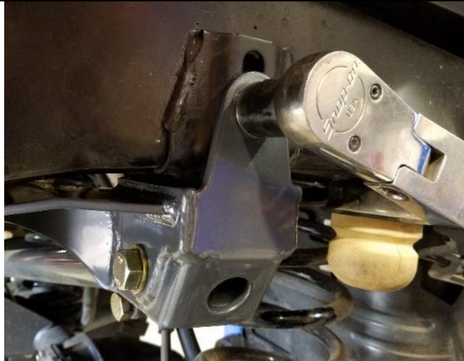
Figure 6. Torqueing the 7/16” Thru Frame Bolt