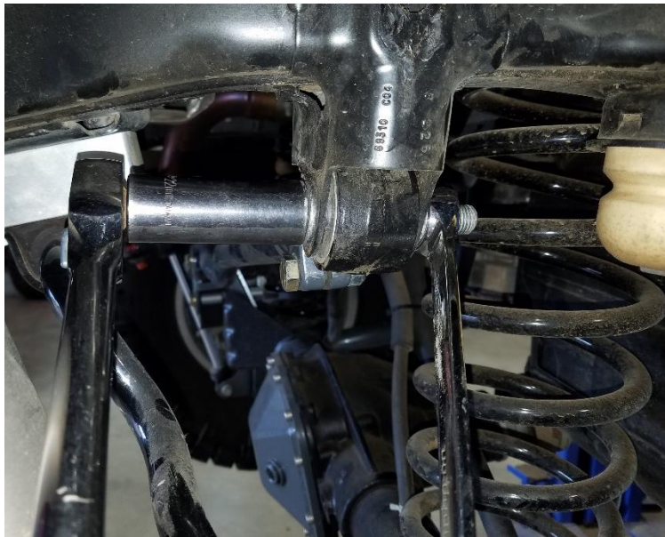
Figure 1. Removing Rear Track Bar from Mount