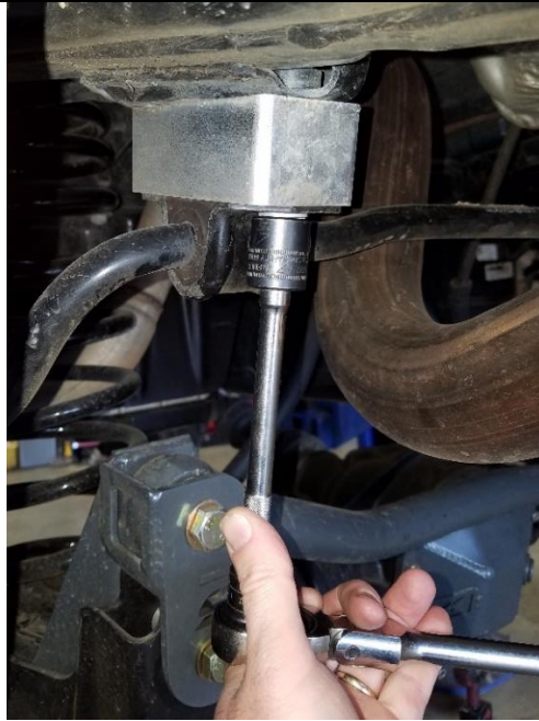
Figure 2. Removing Sway Bar Mounting Bolts