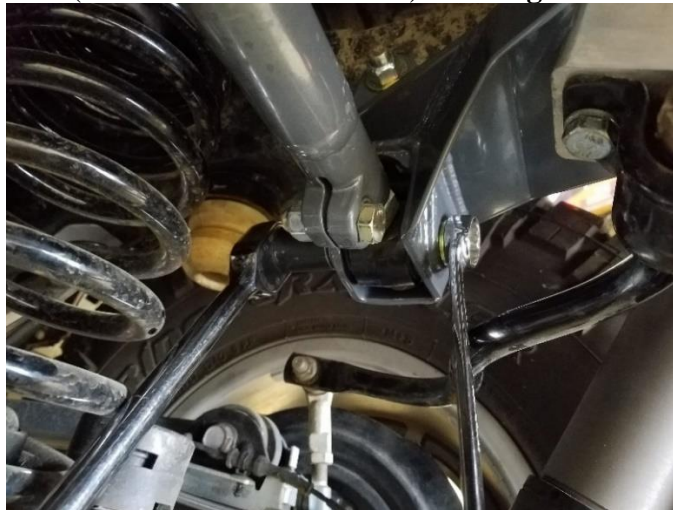
Figure 7. Torqueing the Rear Track Bar Bolt