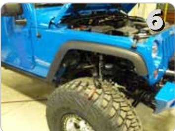
Clip on inner fender flare, attach with three 1/4 x 20 bolts, using flat washers and lock washers, bolts go in from back of fender