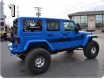
Thank you for purchasing the new TrailMods Removable Fender Flare system. 100% Made in USA.