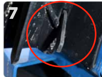
The rubber strap should be sticking through the hole as show above