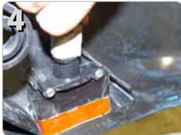
Twist bulb and holder into the new light in the outer fender flare