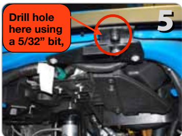
Drill 5/32" hole in support arm, using plastic bracket as guide. Tap hole with 1/4 x 20 tap provided