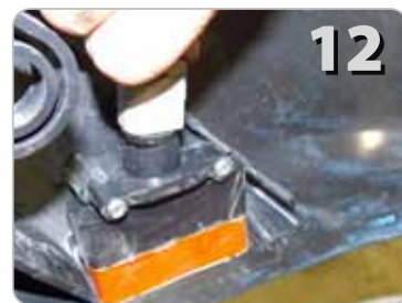
Twist bulb and holder into the new light in the outer fender flare