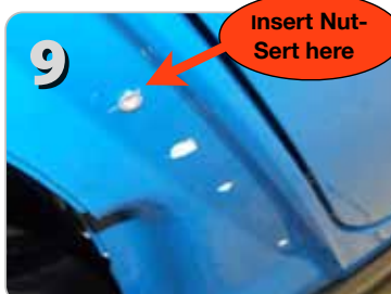
Install nut-sert into hole shown on both sides of vehicle