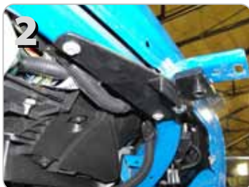
Install plastic Bracket using existing hardware.