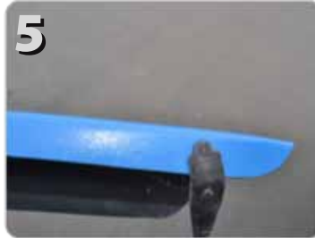
Notice the rubber straps in the edge of the outer flare.