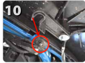
On the front flares you will need to rotate the support bracket until it rests against the boss on the Jeep