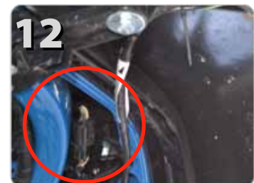
Plug in the light into the connector on the Jeep as shown. To remove just do the steps in reverse order