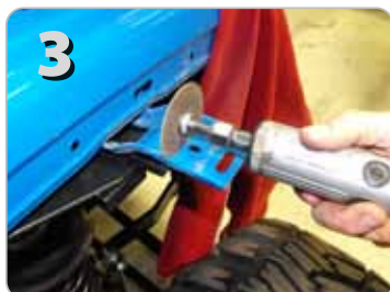
Cut off support arm flush with plastic bracket