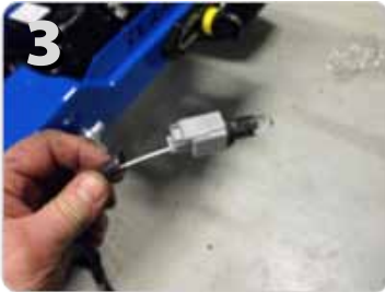
Remove OEM light from stock flare by twisting out of stock light