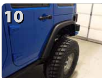
Clip on the inner fender flare. Attach with two 1/4 x 3/4" bolts using washers and lock washers