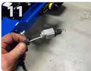
Remove OEM light from stock flare by twisting out of stock light