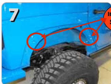
Remove OEM rear flares