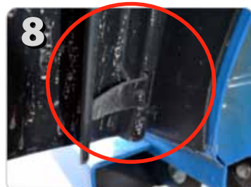
Bend rubber tab over the boss to secure. Work around the flare pulling the straps over the bosses.