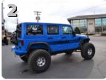
You must have the inner flare kit installed before you can install the outer flares. The jeep should look like this.