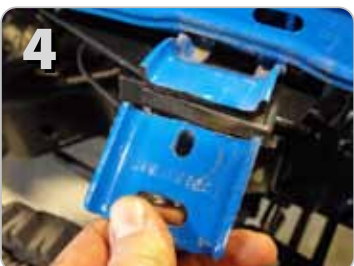
Apply primer or rust inhibitor to the cut edge of the support arm.