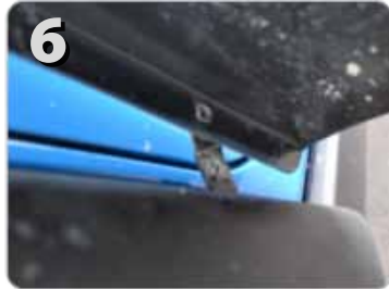
Start on one end of the flare and insert the rubber straps through the holes in the trough of the Inner Flare