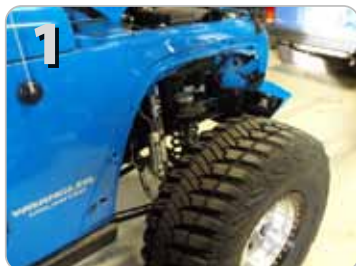
Remove OEM Flares