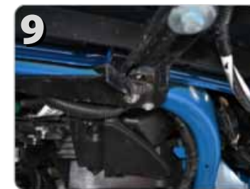
Close the Support handle and you are done!