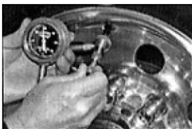
6) Turn valve core until snug.