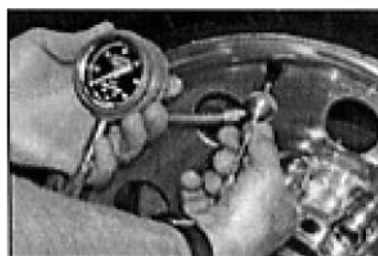
7) Remove the valve stem adapter by turning it counter clockwise.