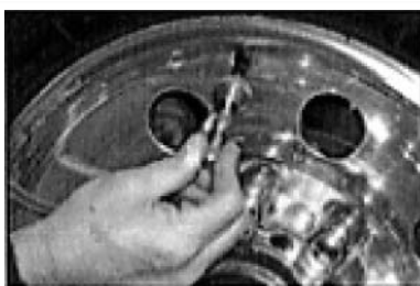
2) Remove valve stem core. Push in valve core remover and turn counter clockwise.