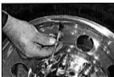
1) Thread valve stem adapter onto valve stem clockwise, all the way down snug.