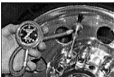
3) When valve core is all the way out, the air pressure will push the valve core remover out and the gauge will read the tire pressure.