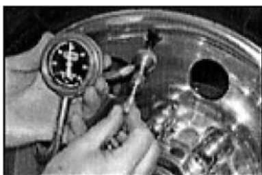
5) When desired air pressure is achieved, leave slide valve pushed in and push valve core remover in and turn clockwise to reinstall valve core.