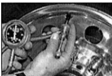
4) Pull out the slide valve to release air. Push in on slide valve to stop air and check pressure.