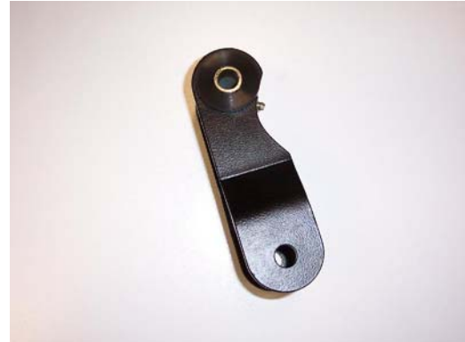
< TOWARD FRONT – PHOTO 3 – TOWARD REAR >