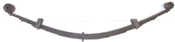
< FRAME END (LARGE BUSHING) – PHOTO 4 – SHACKLE END >