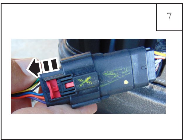
Carefully pull the red tail light harness release switch in the direction indicated.