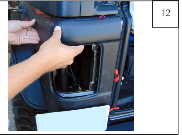
Position the Corner Guard in place and align with the previously cleaned surface. Ensure that the red tape pull tabs are all accessible. Apply pressure to exposed tape.