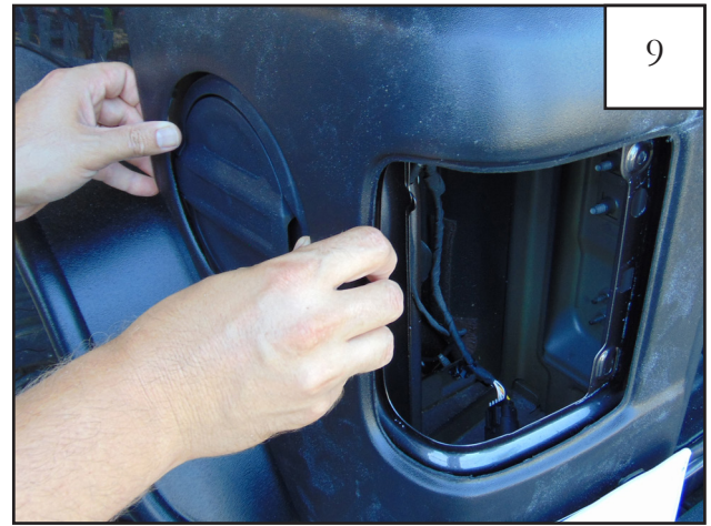
Test fit the Corner Guard in place. Take note of where the red tape liner aligns with the vehicle body.