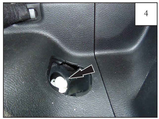
Tail light retaining bolt exposed.