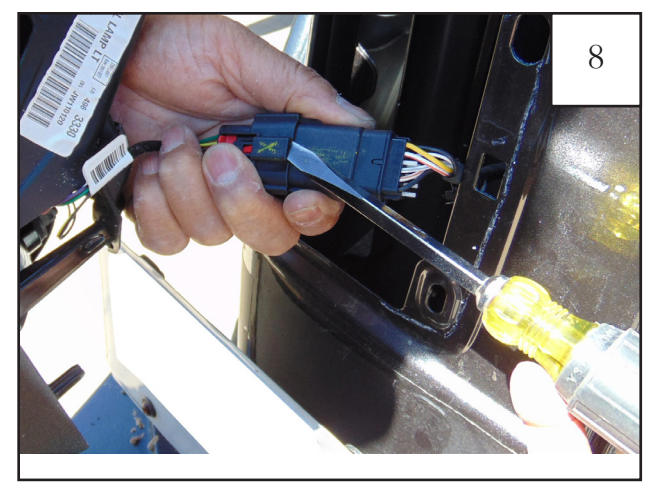
Use a screwdriver to fully disconnect the wiring harness and set tail light assembly aside.