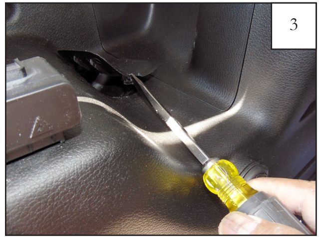
Use a screwdriver to pry open the cover for the tail light retaining bolt.