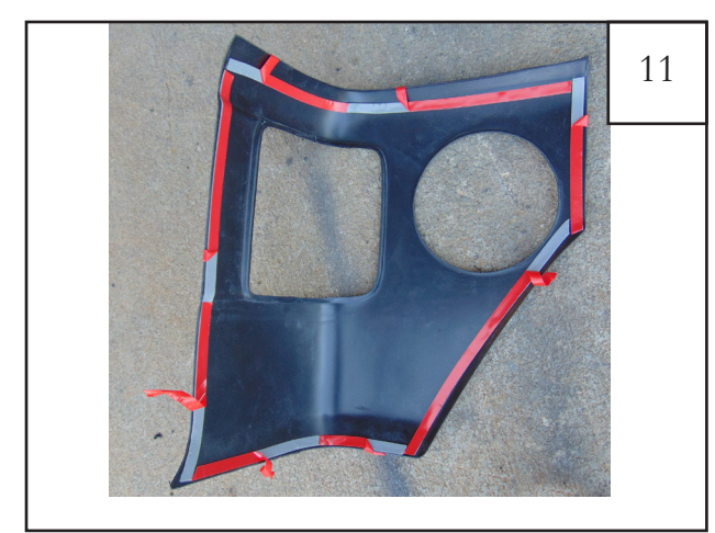
Peel back 2" of red tape liner on all flanges to expose adhesive and create a pull tab.