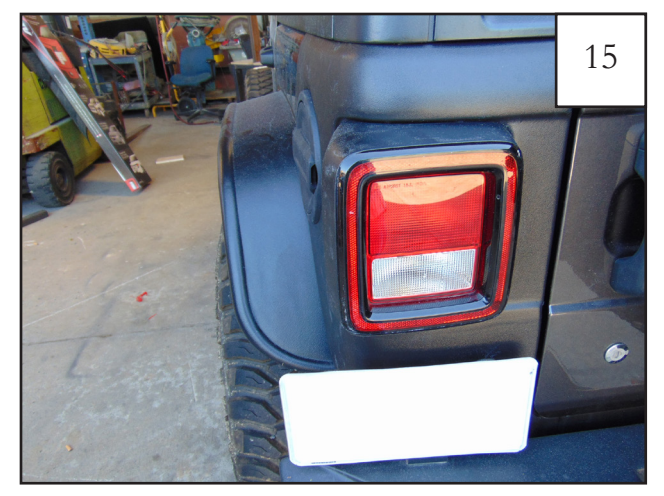
Reverse Steps 2 thru 8 to reinstall tail lamp assembly.