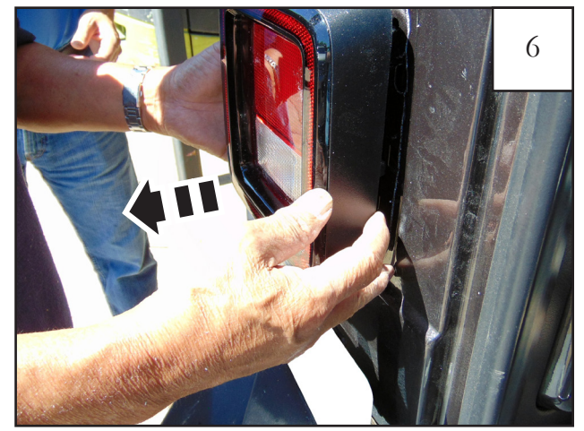
Carefully pull the tail light assembly away from the vehicle.