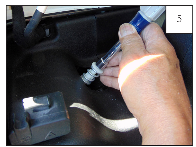
Use a 10mm nutdriver to remove the tail light retaining bolt.