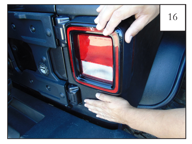
Repeat Steps 1 thru 15 to install passenger side Trail Armor.