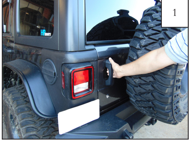
Open rear hatch.