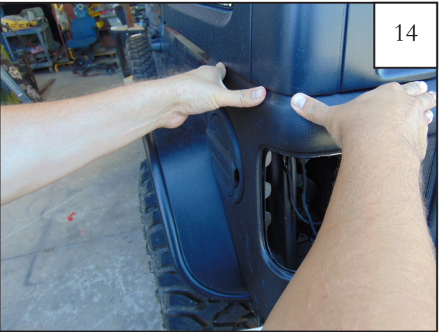
Apply FIRM pressure to all flanges to ensure proper adhesion.