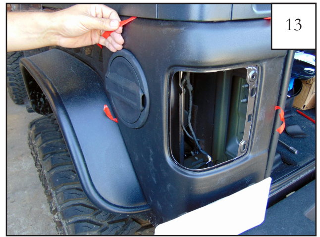
With the Corner Guard in its final position, begin pulling tape tabs to remove remaining tape liners. Proceed in a clockwise patter, beginning with the upper left hand side as shown above.