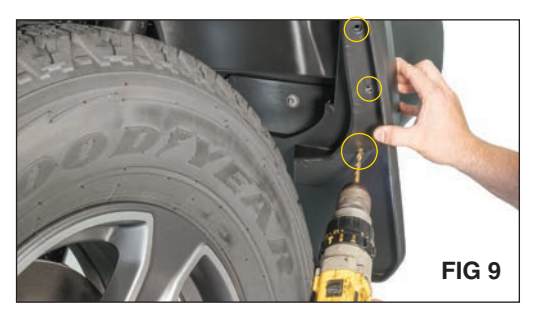
While holding the splash guard in place on the bumper drill 3 holes through the splash guard into the bumper using a drill and ¼" drill bit. (FIG 9)