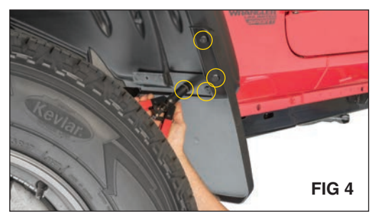
While holding the splash guard in place, use a plastic rivet gun to install the 4 plastic rivets into the now open holes. (FIG 4)