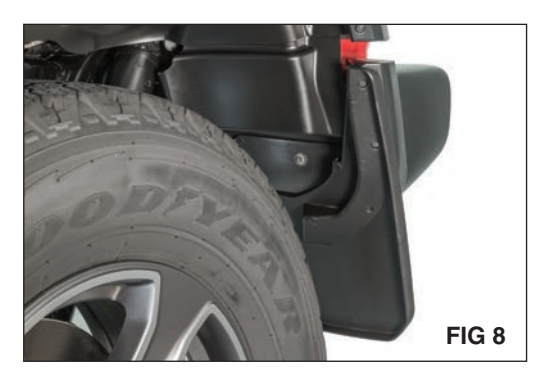
Using the provided tapping screw, loosely install splash guard as shown. Take care to line up edge of splash guard with edge of bumper. (FIG 8).