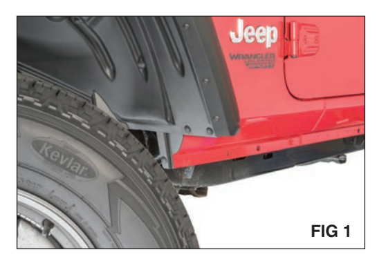
Put on safety glasses. Start the vehicle and turn the wheel to gain access to inner wheel liner. See (FIG 1).