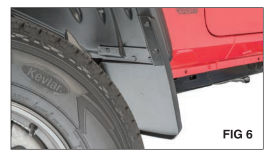
Install a plastic rivet through splash guard and wheel liner. (FIG 6) Repeat all steps for other side of the vehicle.