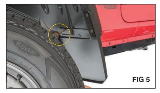
Locate the 5th small hole in the splash guard and drill through it and into the wheel liner using an electric drill and ¼" drill bit. (FIG 5)