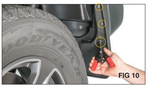
Using a plastic rivet gun install the 3 plastic rivets into the ¼" holes. (FIG 10).