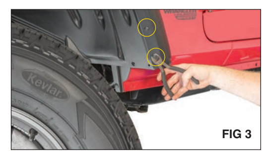
Using diagonal cutting pliers remove the two plastic rivets from the fender flare shown in (FIG 3).