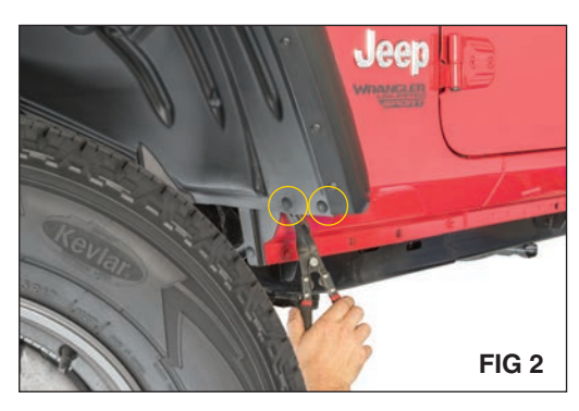
Using a clip removal tool remove the two Christmas tree clips shown (FIG 2).