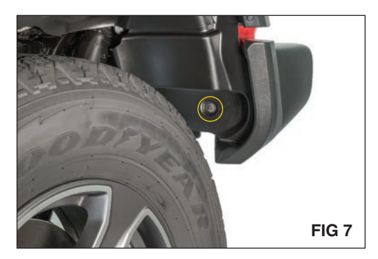
Put on safety glasses. Using a 8mm socket and ratchet remove the inner flare liner bolt and discard. (FIG 7).