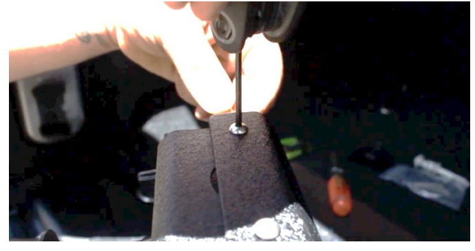
Repeat Steps 1-3 on the opposite side.

With a 3mm Allen key, secure the two plates to one another with 5 of the included bolts and serrated nuts. You may need to use an 8mm wrench if you have difficulty tightening them.