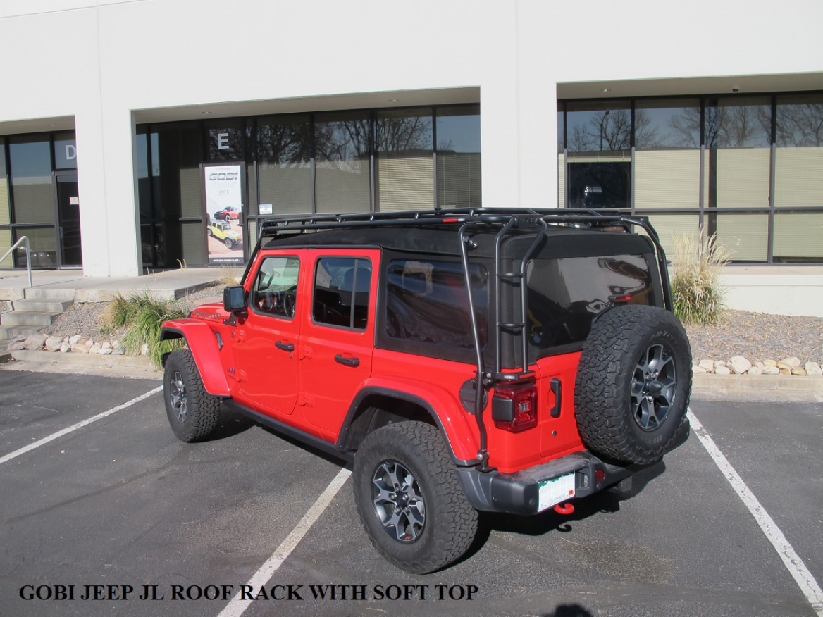
GOBI JEEP JL ROOF RACK WITH SOFT TOP