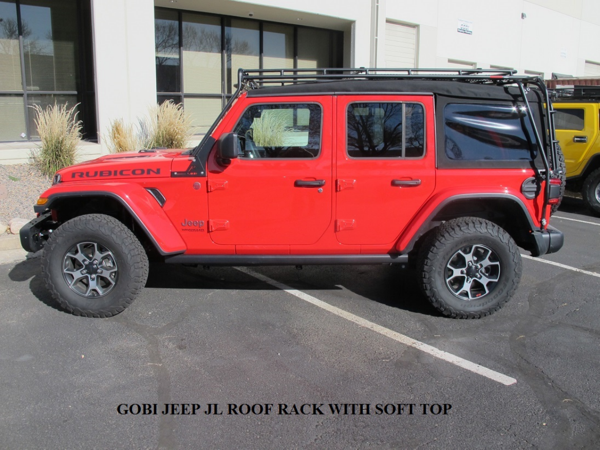
GOBI JEEP JL ROOF RACK WITH SOFT TOP