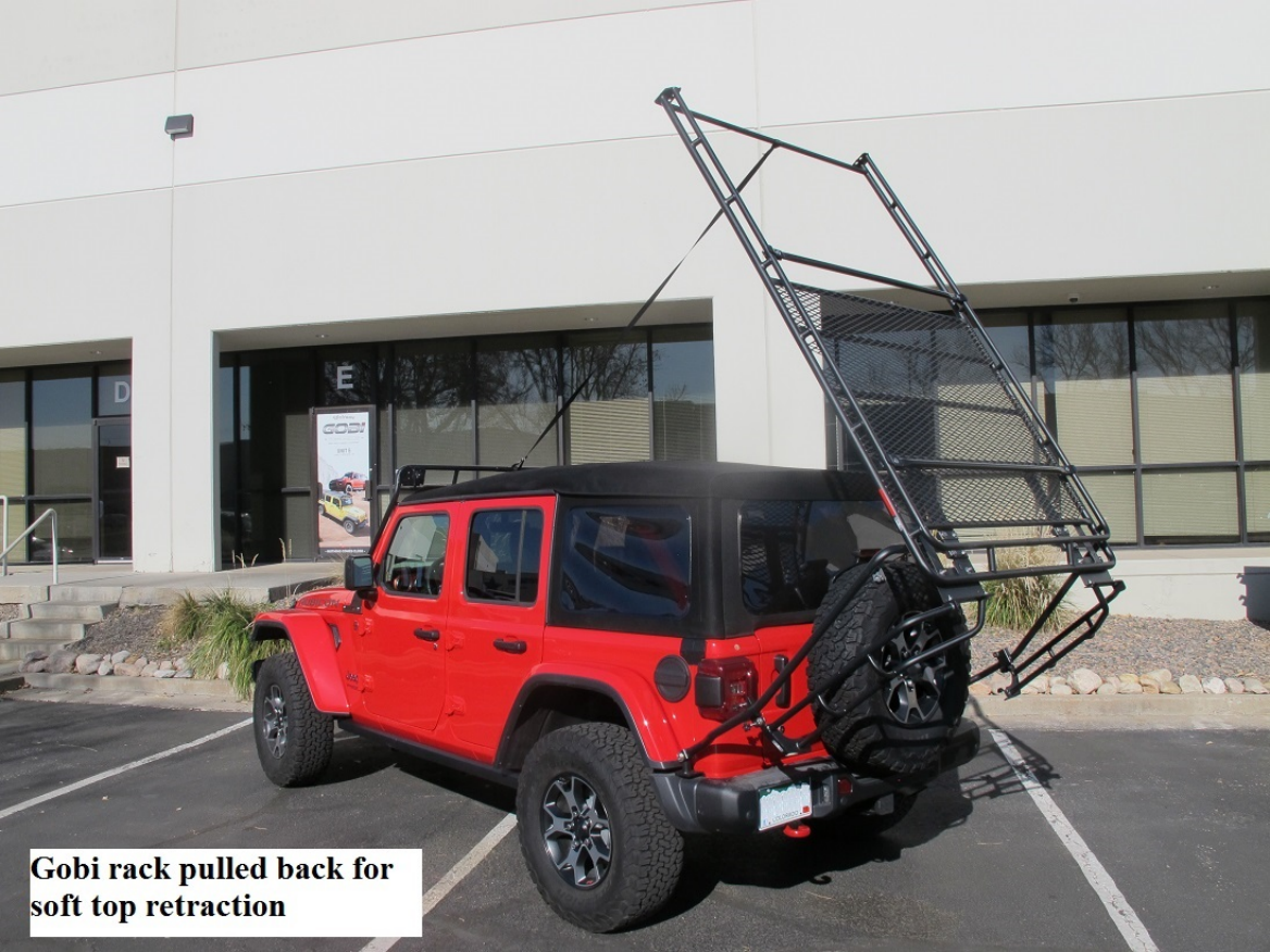
Gobi rack pulled back for soft top retraction