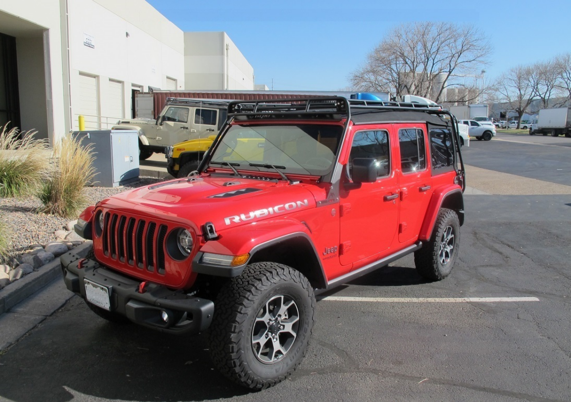
GOBI JEEP JL ROOF RACK WITH SOFT TOP